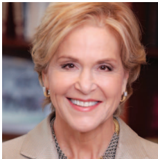
PUBLIC/NON-PROFIT SECTOR WOMAN OF THE YEAR JUDITH RODIN, Ph.D. PRESIDENT THE ROCKEFELLER FOUNDATION