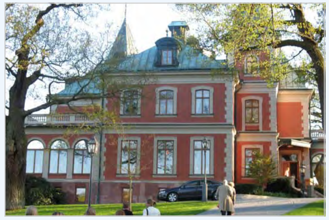
Villa Täckä Udden