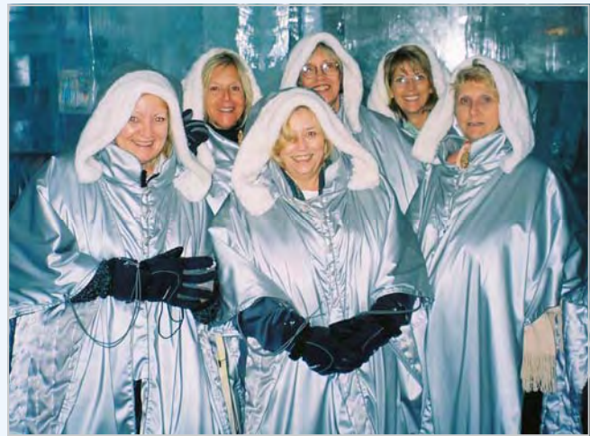
Delegates explore the Ice Bar, a Stockholm "leisure attraction"