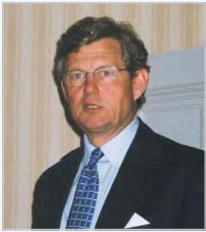
Jacob Wallenberg, Chairman, Investor AB