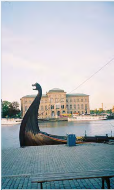
Waterway in Stockholm