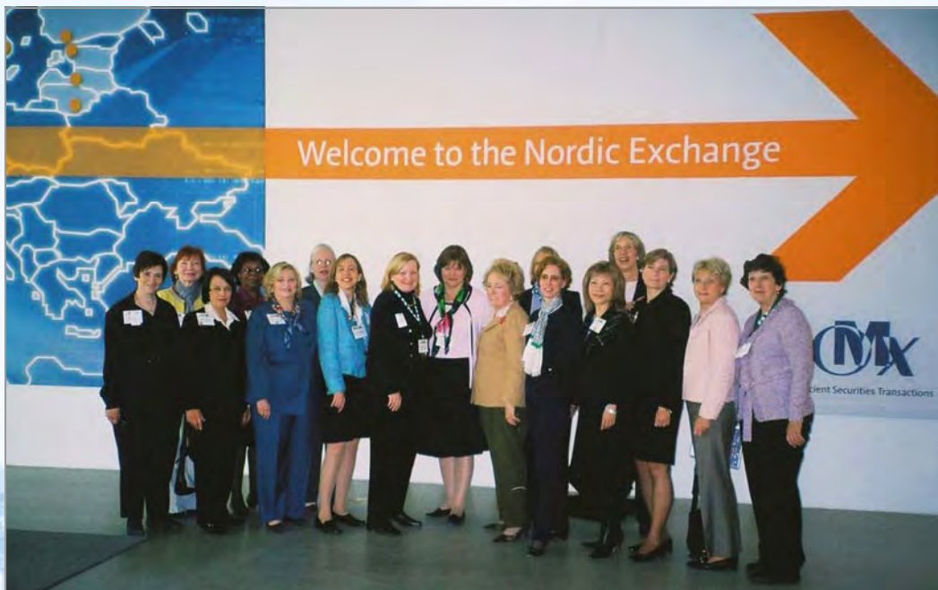
Delegation in Stockholm at the Nordic Stock Exchange

22 ND ANNUAL INTERNATIONAL CONFERENCE MAY 11-21, 2006