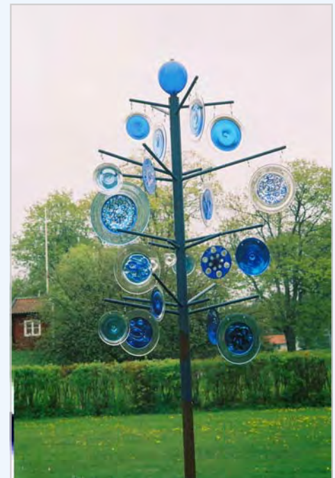
Glass sculpture at Orrefors Kosta Boda AB