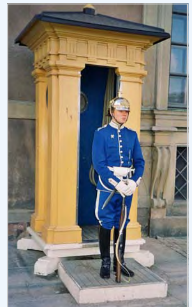
Right: Guard at the Royal Palace