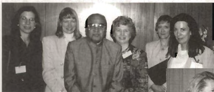
ABOVE: With Mr. Sibri N.K.P. Salve, Union Minister of Power in New Delhi