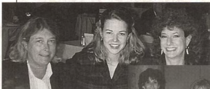
Delegates arrive in India prepared and excited