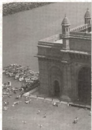
Gateway to I