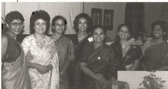
ABOVE: A distinguished panel on Women in Business