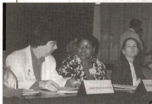
Delegates gain insight into India's political and economic transformation