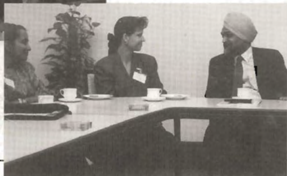
RIGHT: Meeting with Mr. Montek Abluwalla, Finance Secretary