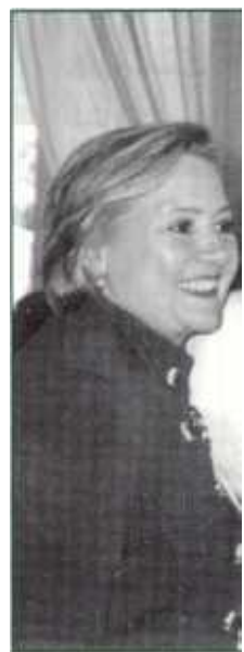
U.S. Ambassador to Ireland reception at Dromoland Castle